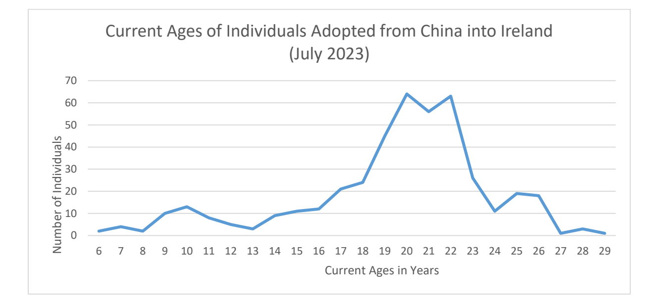
Figure 2: Current ages of individuals adopted from China into Ireland (as of July 2023)

The range of current ages of individuals adopted into Ireland from China is illustrated in Figure 2. The mean current age of a child adopted from China into Ireland is 19 years old, as of July 2023. While the ages range from 6-29 years old, roughly three quarters (72%) are currently aged between 16 and 23, with 19-22 year olds accounting for over half (53%) of the total figure. The average age at adoption was 1 year, 3 months at the time of the adoption order prior to the Adoption Act 2010, and 2 years, 5 months after the Act. In terms of gender, 89% of the children were female, and 11% were male.